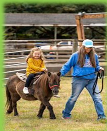
Pony Perfect! A new generation of smiles!

confidence, leadership, equestrian skills, and teamwork. The future of LOH is in great hands with these young riders!