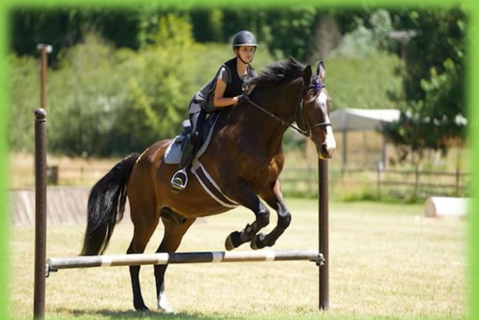
Summer Camp - Jumping