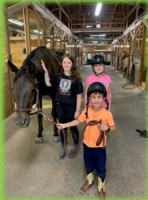
Happy Summer Campers!

The Riding Academy Summer camps were very popular again this year. Most camps were filled with a variety of riders, from beginners to advanced. The RA camps are a great way to introduce new riders to horses and to improve the riding skills of more advanced riders. It's also a great way to highlight our amazing interns and instructors. Look for more information in upcoming winter camps.